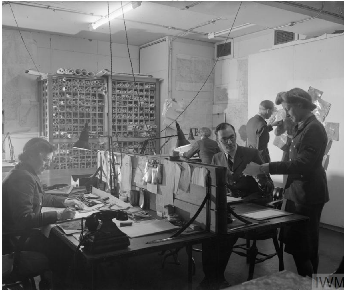
RAF and WAAF intelligence officers and their staff at work in the Map Section in the Operations Block at Headquarters, Bomber Command, near High Wycombe, Buckinghamshire.